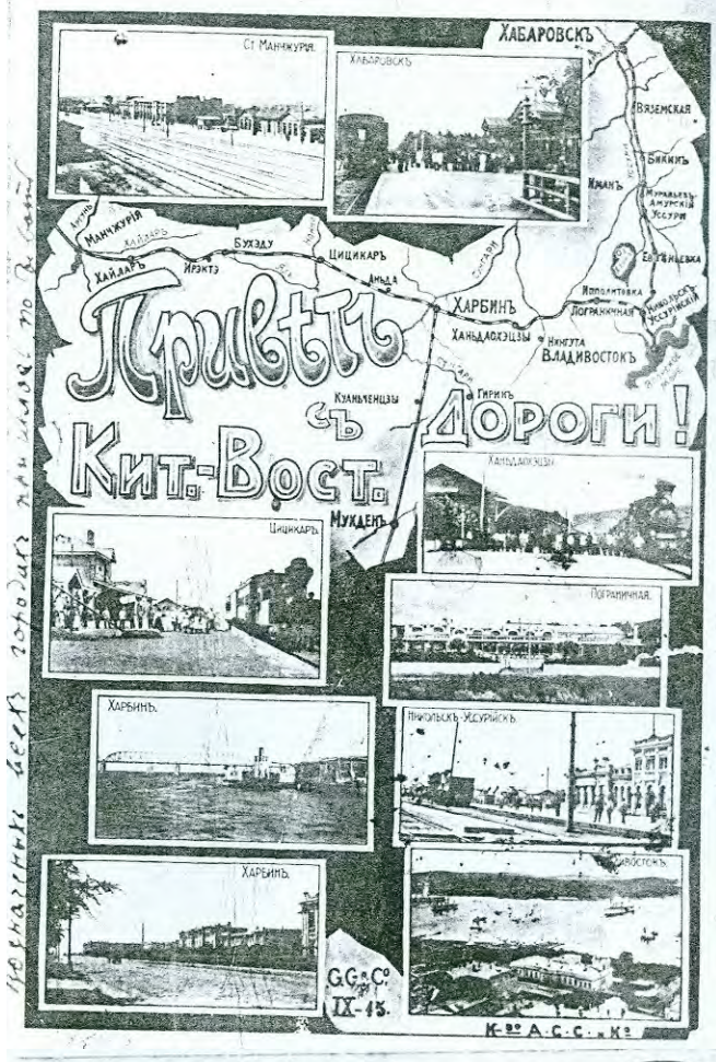
Illustration 5 & 6

Handokhetze station, Manchuria; a building at Pogranichnaya (possibly the station building) just outside Chinese Manchuria; an engine standing at the station at Nikolks-Ussiriski and finally the docks at Vladivostok. Illustration 6 – this postcard was sent to the town of Koti in the St Petersburg district, but went on an eastbound train. The oval postmark is of route Khabarovsk-153-Vladivostock, 13-10-1914.